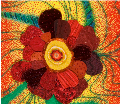
Detail by Valerie Bledsoe