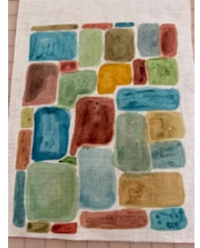
Water Color Sample by Deb Spofford